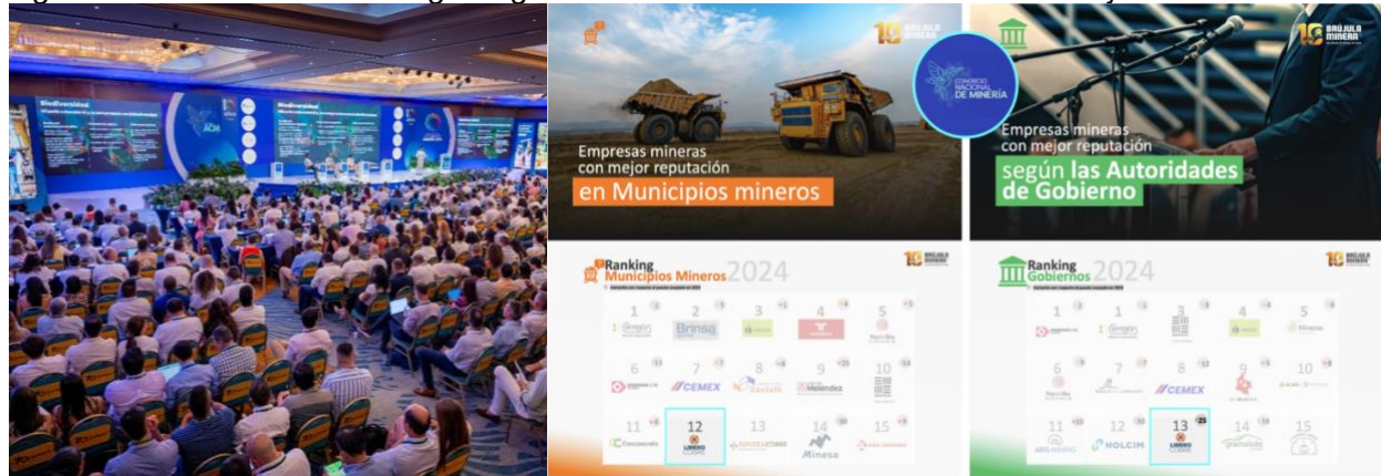
Figure 2 – 2024 National Mining Congress and the results of the 10 th Annual Brújula Minera

This recognition not only validates Libero Copper’s efforts to build lasting relationships with local communities and government authorities but also underscores the solid foundation necessary for advancing a project of Mocoa Porphyry Copper-Molybdenum Deposit’s importance. The company’s strong reputation has been a crucial factor in preparing to move the project forward, ensuring alignment with all stakeholders and a commitment to responsible development.